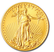
2009 $50 Gold Eagle