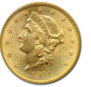
1904 $20 Liberty