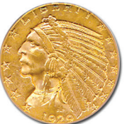
1929 $5 Indian